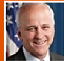
Commissioner Jim Towey